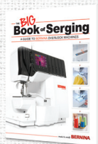
BIG Book of Serging