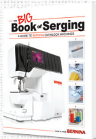
BIG Book of Serging