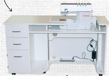
BERNINA Serger Studio