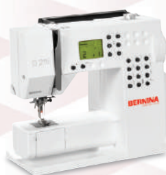
B 215 MSRP $ 1,349