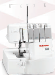
B L450 Serger MSRP $ 1,399