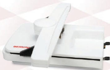
B 7-Series Embroidery Module MSRP $ 2,199

Purchase a B 765 SE and choose one of these FREE gifts 2 :